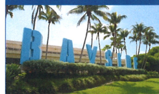
Fabulous Shopping at Bayside Marketplace