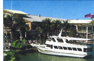
Celebrity-Spotting Cruise on Biscayne Bay