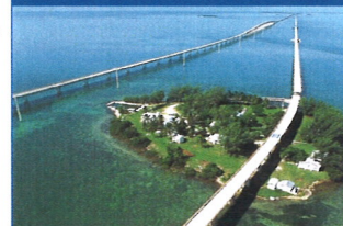
The famous 7-Mile Bridge to Key West